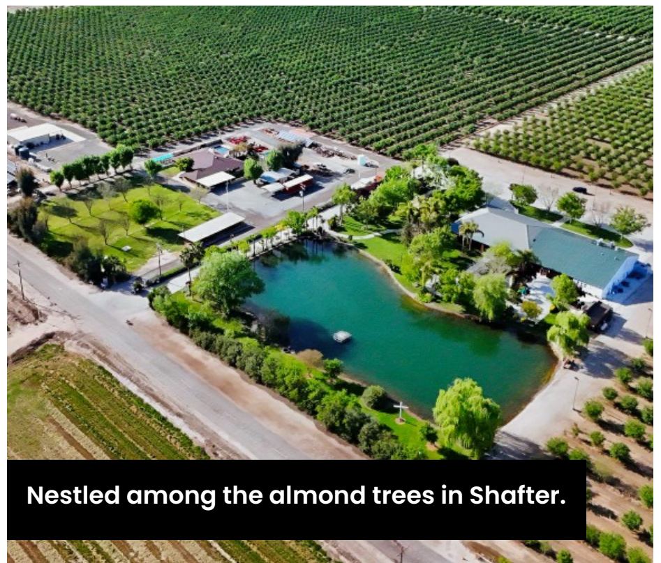
Nestled among the almond trees in Shafter.

Just minutes from Bakersfield, Park Place Banquet Hall offers a peaceful, private setting for your wedding day. Our scenic grounds include a tranquil lake, open garden spaces, and a spacious banquet hall with floor-to-ceiling glass doors for a seamless indoor-outdoor experience. We host only one event per day, giving you full access to the venue. With ample parking just steps from the hall, Park Place is perfect for intimate elopements or micro weddings—customized to make your day unforgettable.